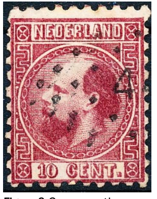
Figure 8 Compare these perforations and their Figure.

In order to compare this above illustration with the real thing, here is the same stamp, but a Type 2 printed version. The spacing between the stamps on the printed sheet was very small, so to get a perfectly centred copy is very difficult and thus the perforations enter the design usually on two sides of the stamp. The above picture does not have position to the previous any space whatsoever on any side and thus it is my