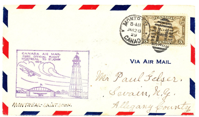
Figure 6 A 1st Flight cover from Montreal to Saint John and then on to the US. From the collection of S.W.

one country. The cover shown on the front page is just one which travelled by air from the Netherlands to present day Indonesia. Besides crashes at sea and the loss of the mail, other hazards exist with air mail, such as crashes on land. I saw on a popular stamp website a cover that had been recovered and charred by the fire from the crash but was ultimately delivered to its destination. In conclusion, I am sure there is more to this topic than what is presented here, but it needs a person who is able to shed light on this particular field of philately.