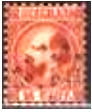
Figure 7 Although the picture is fuzzy, the key thing to see is the perforations

One of the ways I fix my stamp habit is to visit eBay. Recently, while going through my speciality area, the Netherlands, I came across this particular scan. It drew my attention immediately. It looks like an ordinary stamp, and indeed, a quick scan of the Scott's Catalogue will suggest that it is a common stamp, with no significant value. Unfortunately, that is one of