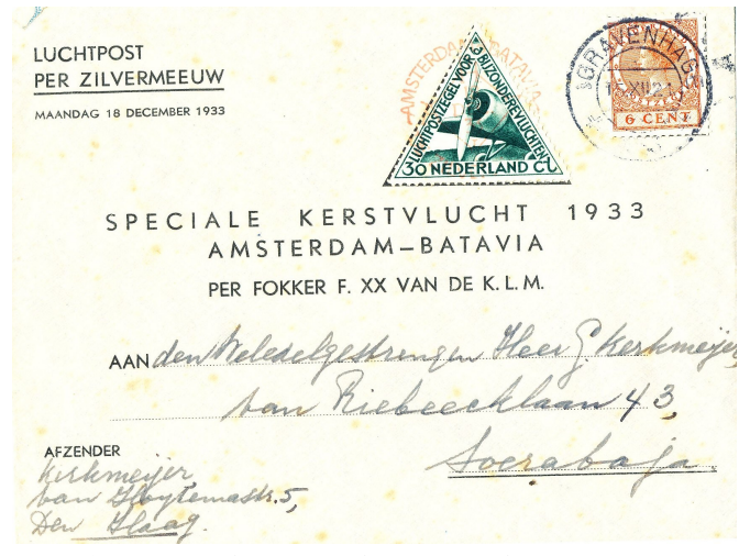
Figure 3 A special Christmas flight cover from The Netherlands to Indonesia made in 1933.